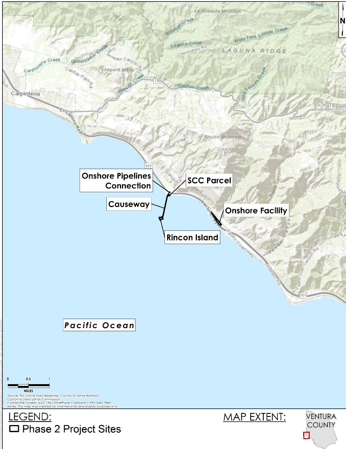
Figure ES-1. Site Location Map

of the facility's oil and gas well plugging and abandonment process (Phase 1). Figure ES-2 provides an overview of the proposed Project sites.